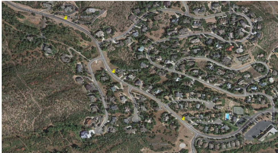
Figure 1: Proposed Traffic Calming Locations