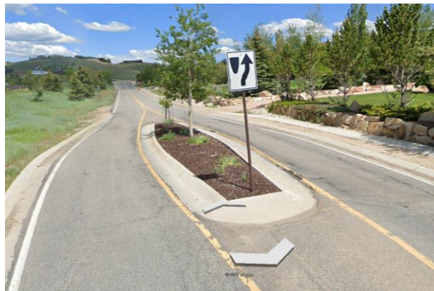
Figure 2: Example of Center Island on Trailside Drive